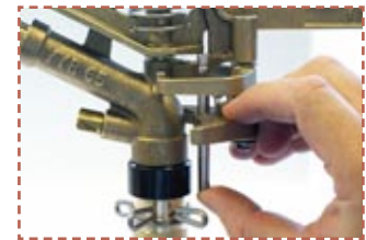
Easy part-circle adjustment

Long range nozzles (long vane) + short range nozzle